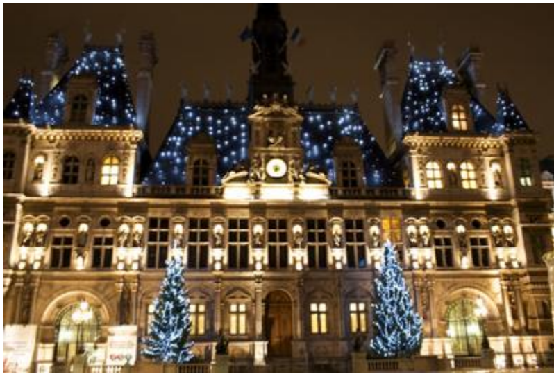
Hôtel de Ville at Noël.

We hope this note finds you well and not too terribly stressed during this holiday season. For your last-minute gifts, consult our guide to the best gifts from Paris , all of which can be ordered online.